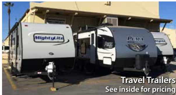
Travel Trailers See inside for pricing