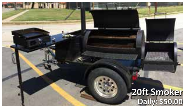
20ft Smoker Daily: $50.00