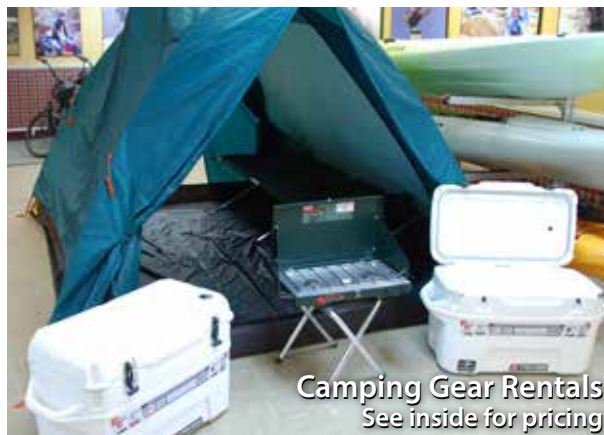
Camping Gear Rentals See inside for pricing