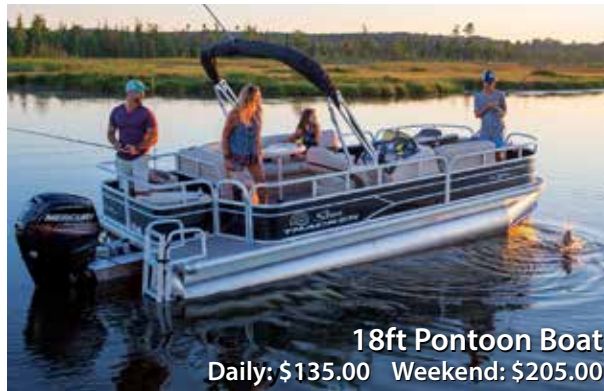
18ft Pontoon Boat Daily: $135.00 Weekend: $205.00